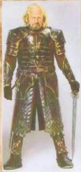
Théoden, King of Rohan Portrayed by Bernard Hill

Film: Lord of the Rings: The Two Towers and Lord of the Rings: Return of the King